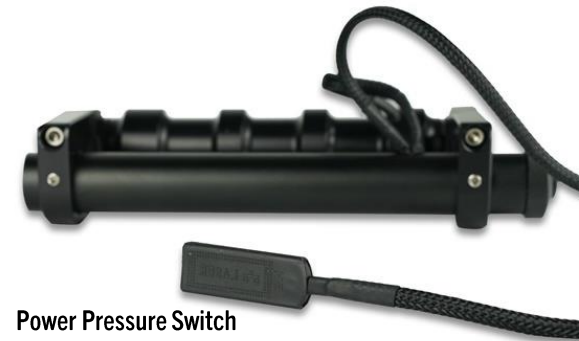
Power Pressure Switch

Modes: Full Bright, Half Bright, Strobe & Off